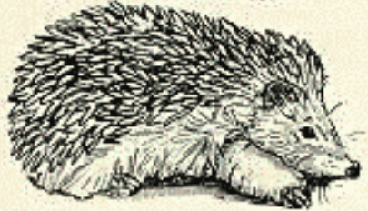
... SOME TIMES THEY LIVE IN BRUSH PILES

WE SPONSORED THREE HEDGEHOGS AT ST TIGGYWINKLES. ONE HAD A BROKEN LEG, ONE WAS LISTLESS AND NEEDED MEDICINE AND ONE WAS AN ORPHAN AND NEEDED SPECIAL CARE. RYESHIP, JULIE AND MOWGLI HAVE BEEN RELEASED BACK INTO THE WILD.