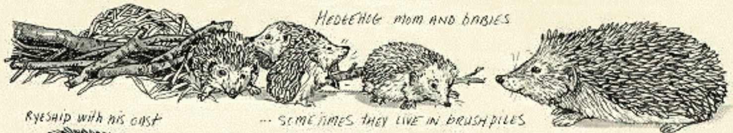
Hedgehog mom and babies

HEDGEHOGS ARE ABOUT THE SIZE OF A GUINEA PIG, AND THEY ARE COVERED WITH PRICKLES. HEDGEHOGS ARE GENTLE. THEY ONLY HAVE TO ROLL UP IN A BALL TO BE SAFE FROM PREDATORS. THIS IS A DISADVANTAGE IF A CAR IS COMING. THAT IS WHY ST TIGGYWINKLES HAS LOTS OF PATIENTS. HEDGEHOGS ARE ONE OF MY FAVORITE ANIMALS. SOMEDAY I'D LIKE TO THINK UP A HEDGEHOG STORY FOR A BOOK.