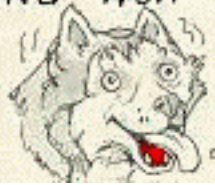
Perky wants a bone

Another book, The First Dog , came about because I wondered about our Husky, Perky Pumpkin. I looked at our dog's expressions, and tried to guess what she was thinking. I had to use my imagination and "wolf-up" Perky for the book. That was the best part.