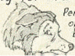
Perky was on the bed