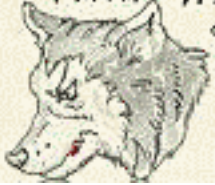
She wants to chase the cat