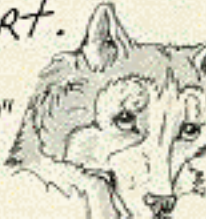
"I'm a good dog"