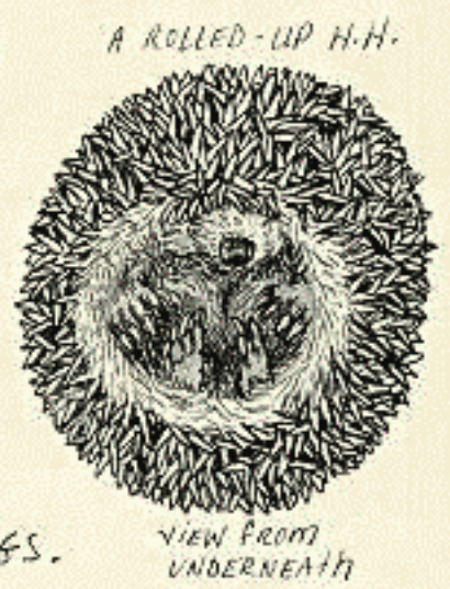
A ROLLED-UP H.H.

A FRIEND IN ENGLAND SAID THAT THE HEDGEHOG THAT LIVED IN THEIR YARD LIKED TO TEASE THEIR GOLDEN RETRIEVER. HEDGEHOGS FORAGE AT NIGHT FOR INSECTS. EVERY EVENING THE HEDGEHOG ATE THE DOG'S FOOD. THEN IT FLIPPED OVER THE BOWL WITH A CLANK, AS IF TO SAY "I'M DONE, THAT WAS GREAT." EXPERTS THINK HEDGEHOGS JUST NATURALLY TURN OBJECTS OVER LOOKING FOR BUGS.