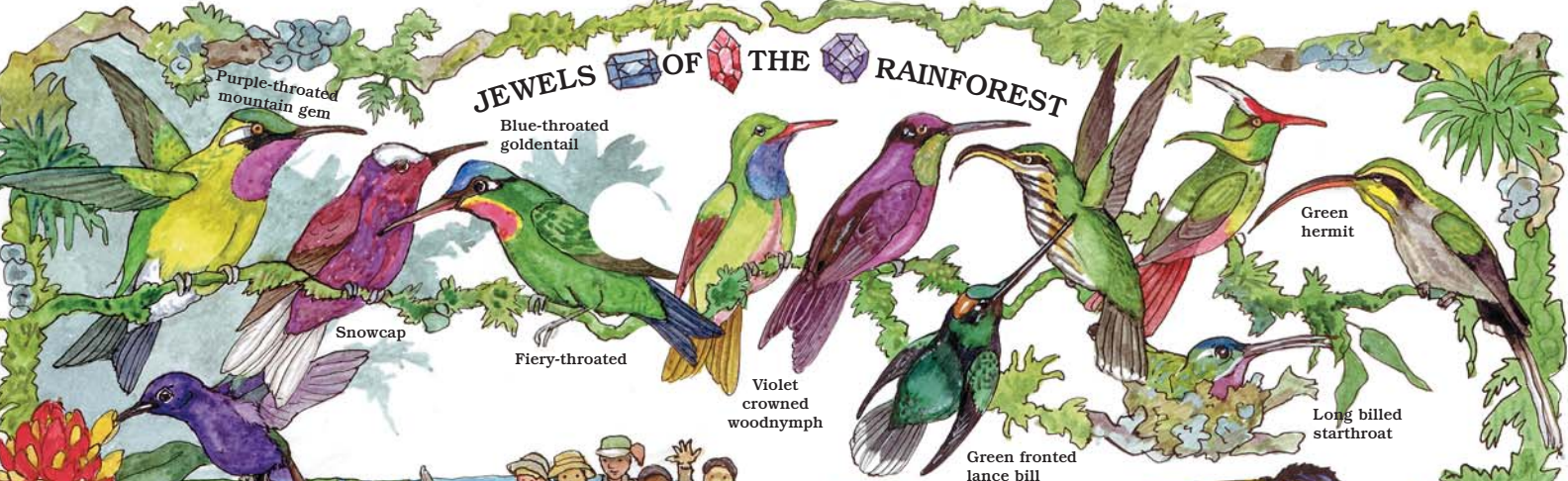
Purple-throated mountain gem