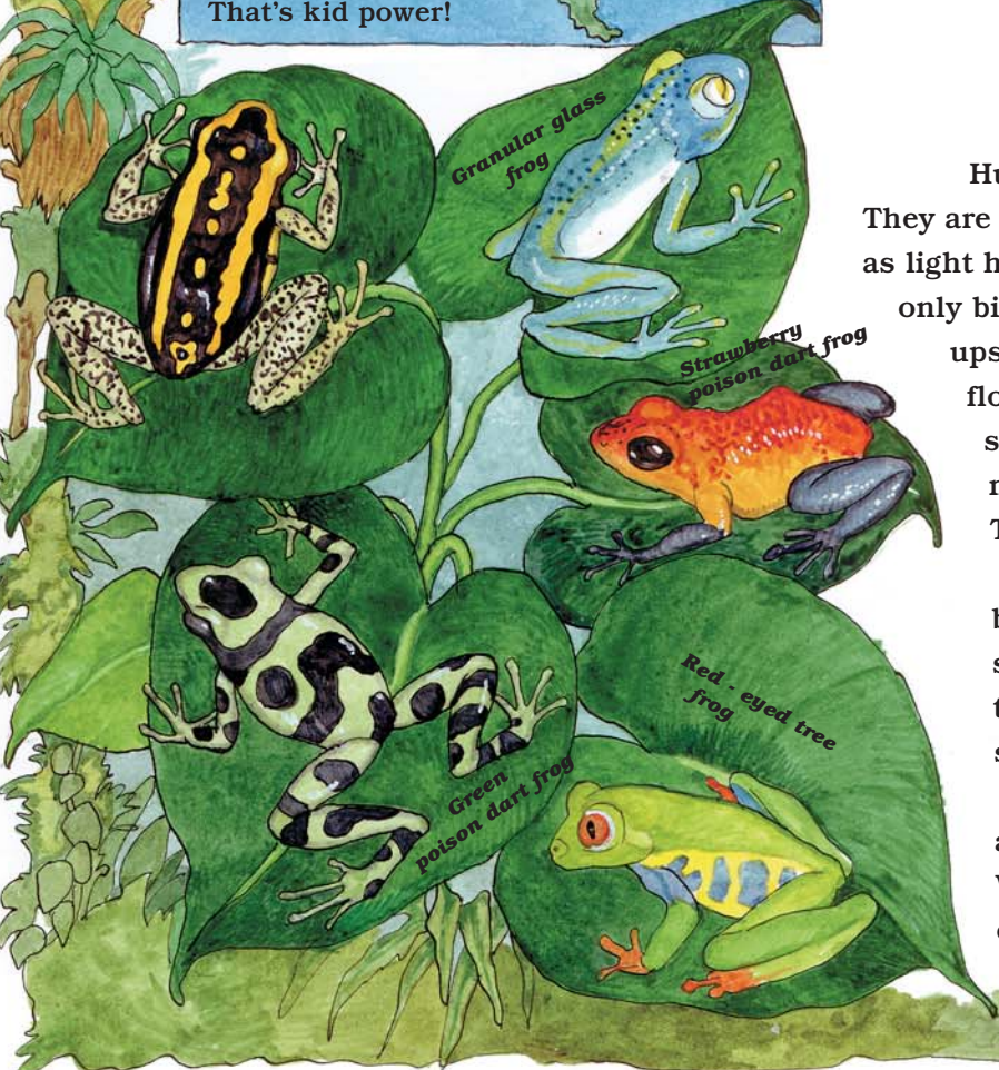
Granular glass frog

Like jewels, these sparkling beauties are precious and some are very rare. When rain forest is protected, their chances of survival are greater.