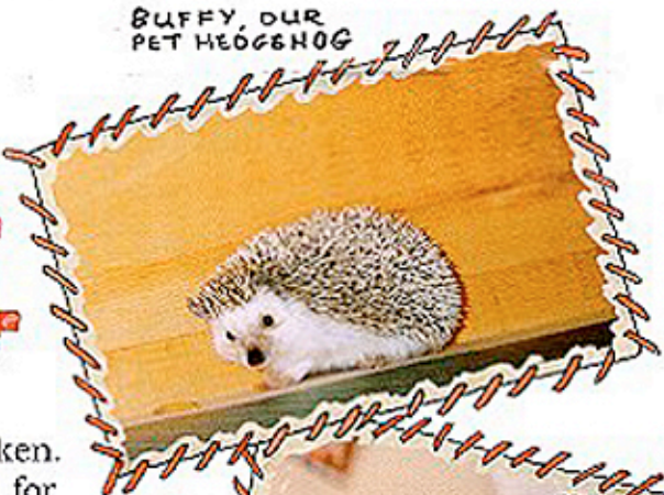
BUFFY, OUR PET HEDGEHOG

I decided I must have my very own chicken. I needed to observe her to draw her well for my book.