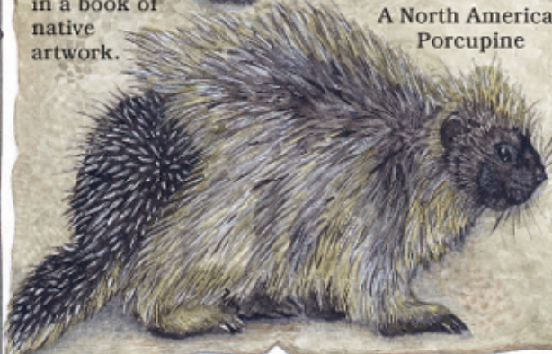
A North American Porcupine