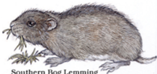
Southern Bog Lemming

Lemmings are related to voles and are mouse-like creatures that live in Northern North America in burrows. They make tunnels under the snow. Although they do not live as far north as the North Pole they make excellent elves for Santa. They do not jump off cliffs into the ocean in large groups. That is a myth.