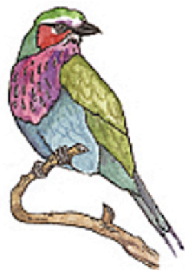
Lilac Breasted Roller

One of the most colorful birds in the Okavango Delta, this bird likes to perch where you can't miss it. It's looking for insects, its favorite food. Its colors are vibrant, and it is so beautiful, Botswana has chosen it for its national bird.